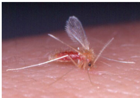
Fig. 2 A female of P. (Transphlebotomus) mascittii almost completely engorged with human blood

P. mascittii was originally described from Rome (Italy) and subsequently found in several Mediterranean regions from Spain in the west to Turkey in the east (Seccombe et al. 1993). Moreover, it has been found in north of the Alps in