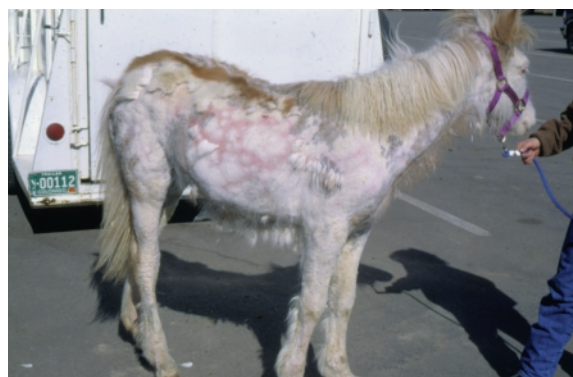
FIG 2: Alopecia and scaling in a six-month-old American paint colt with pemphigus foliaceus. Reproduced with permission from Mueller (2005)