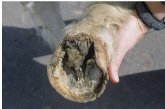
FIG 3: Overgrown hoof of the colt in Fig 2.

when they recurred it was treated intramuscularly with a combination of 2.7 mg/kg per day prednisolone and sodium aurothiomalate (Myocrisin; Aventis Pharma) at 160 mg weekly for two weeks and then 150 mg weekly.